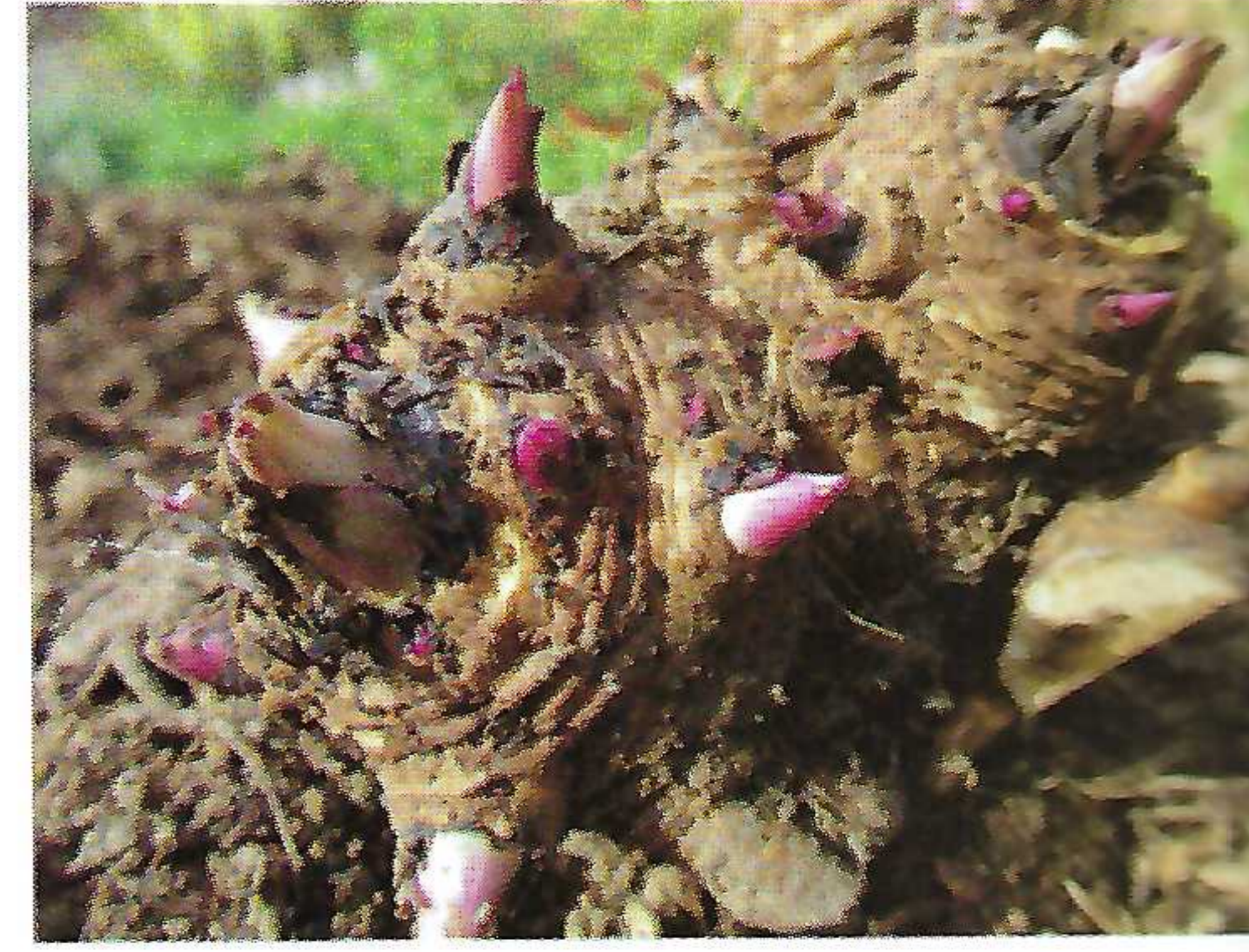
ABOVE LEFT KoruKai Herb Farm overlooking Pigeon Bay. MIDDLE The new drying shed with 72 trays makes drying herbs a breeze. RIGHT Elecampane crown ready to plant in its winter dormancy. TOP OF PAGE Kai harvesting lavender flowers with a flower rake.